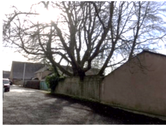
trees to rear of 373 Padiham Road